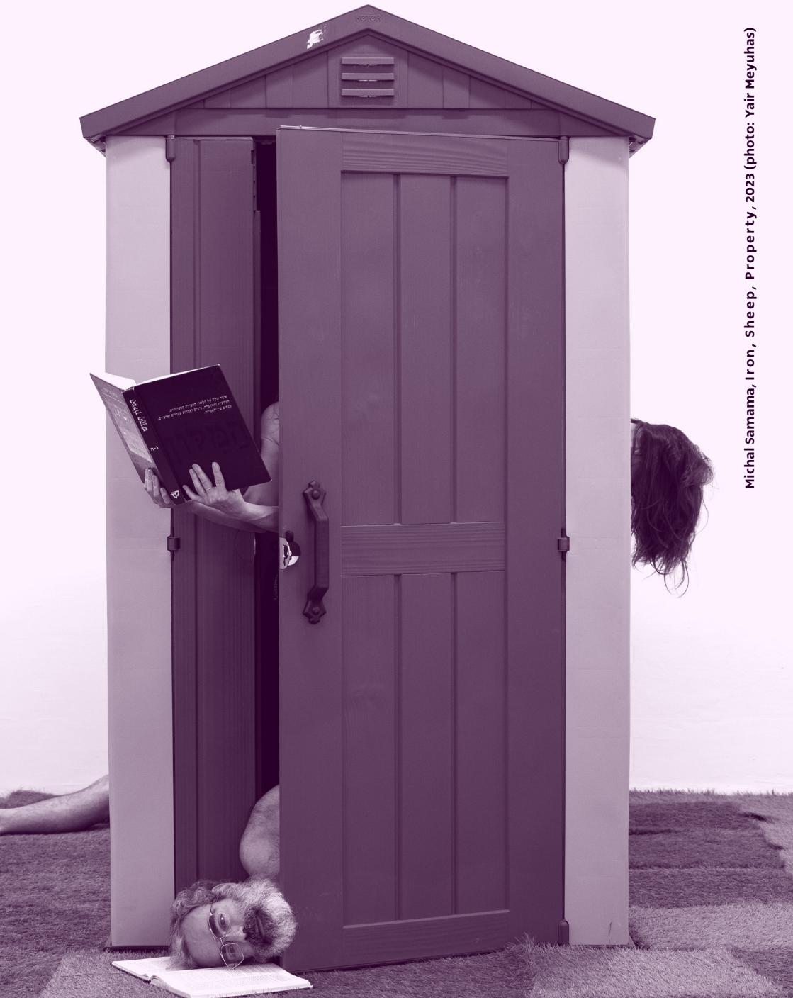
Michal Samama, Iron, Sheep, Property, 2023